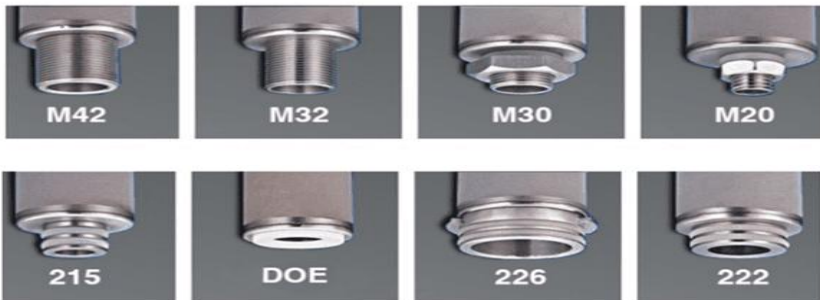
Different types of connectors

Application: Metallurgy, electronics, medical, chemical, petroleum, medicine, aerospace, and other industries